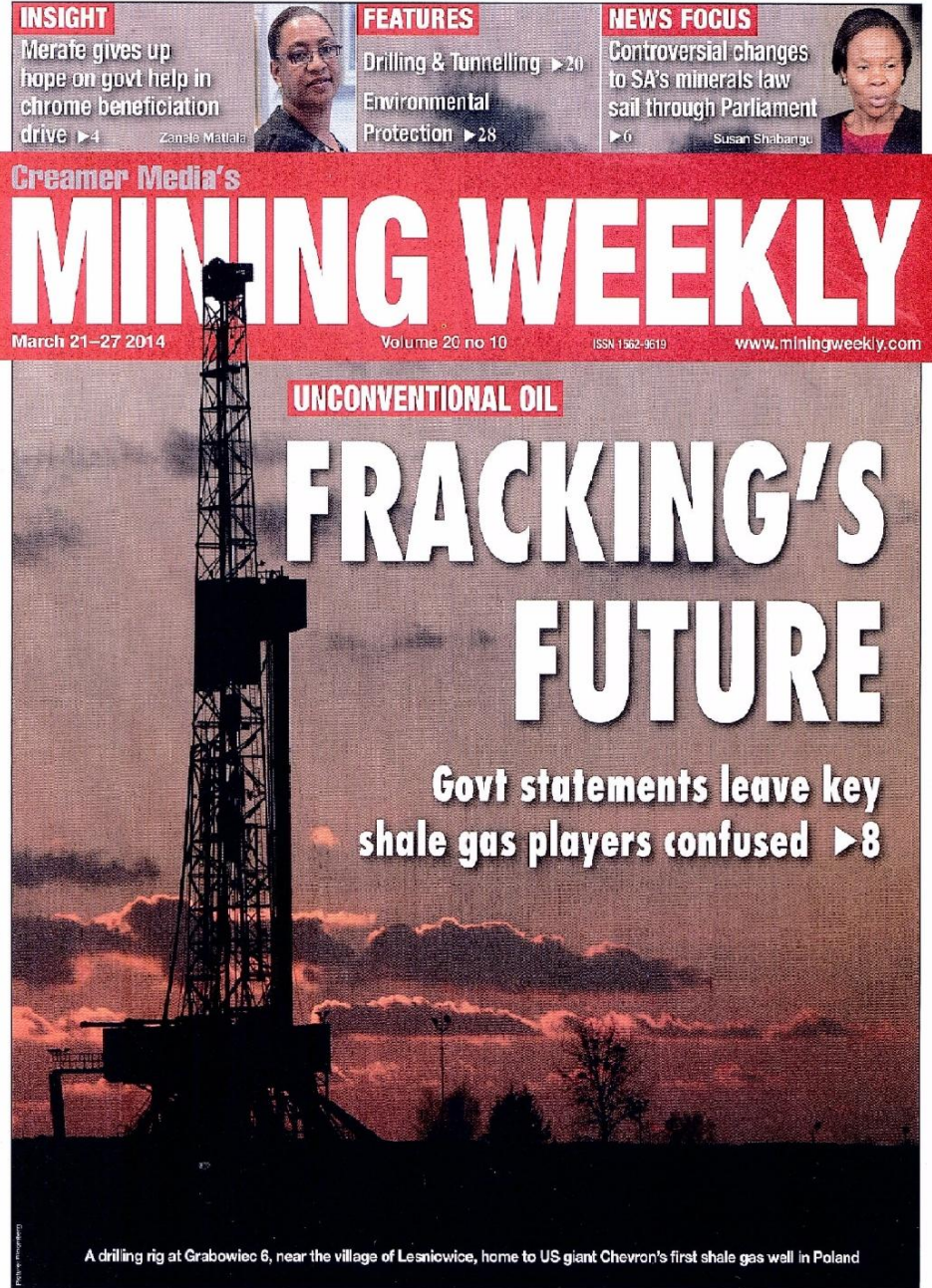
A drilling rig at Grabowiec 6, near the village of Lesnicowice, home to US giant Chevron's first shale gas well in Poland

Govt statements leave key shale gas players confused ▶ 8